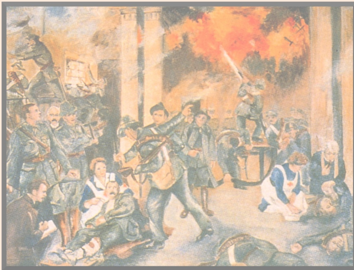
Birth of the Irish Republic by Walter Paget: the General Post Office (Dublin) during the Easter Rising. Wikicommons.

La reproduction ou représentation de cet article, notamment par photocopie, n'est autorisée que dans un strict cadre pédagogique, après autorisation sollicitée auprès du cabinet d'ingénierie mémorielle et culturelle En Envor . En conséquence, et conformément aux dispositions du code de la propriété intellectuelle, seule est permise l'utilisation pour un usage privé sous réserve de dispositions différentes, voire plus restrictives, du code de la propriété intellectuelle. Il est cependant interdit à l'utilisateur, en dehors de cet usage, de copier, modifier, distribuer, transmettre, diffuser, représenter, reproduire, publier, concéder sous forme de licence, transférer ou exploiter de toute autre manière les informations présentes sur le site enenvor.fr . Dès lors, toute autre utilisation est constitutive de contrefaçon et sanctionnable au titre de la propriété intellectuelle, sauf autorisation préalable et écrite de l'auteur ainsi que du cabinet d'ingénierie mémorielle et culturelle En Envor , société éditrice d' En Envor , revue d'histoire contemporaine en Bretagne.